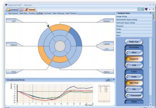
17-segment model and strain curves

Diagnosoft HARP is the first FDA 510k-cleared software designed for the analysis of tagged cardiac MR images. Using HARP methodology, tagged MR images of the heart are analyzed to track the motion of the heart wall for rapid measurement and analysis of myocardium contraction and ventricular torsion.